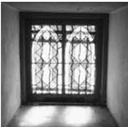
Chapel Bay Window