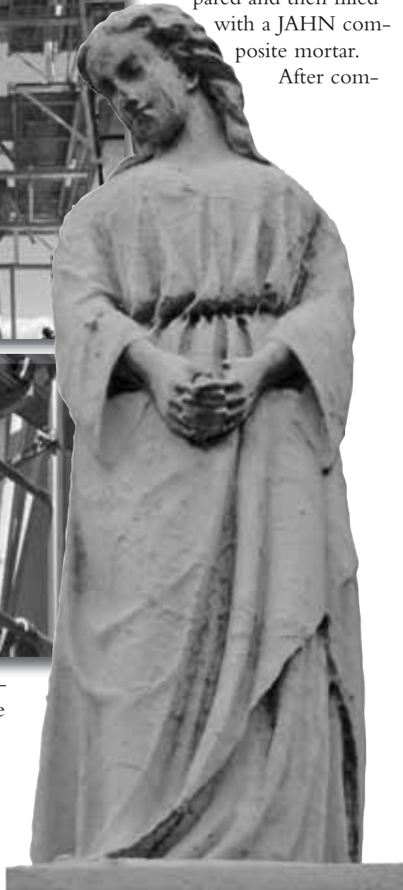
Statue of “Grief”

The VA’s National Cemetery Administration contracted with NPS to perform the work under a $1,750,000 contract. ❧