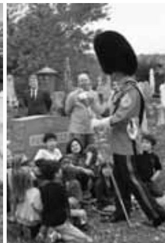
Marine Corps Drum Major