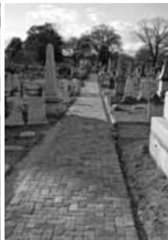
Roberts Walk brick walkway re-laid