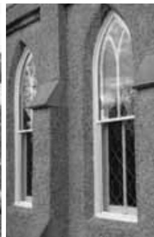
Freshly painted Chapel windows with Lexan protective sheets