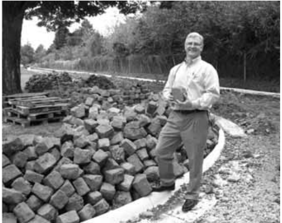
Old Pavers, courtesy of Patrick Crowley, APHCC

of the 15 to 20 pound blocks but sure that we wanted to hold on to them, we put out a call to our dogwalking community to help us pull them from the road bed before they were to be removed by the construction crew. Being the great volunteers they are, over 50 individuals made the trek to the east end to join in the exhausting hand by hand salvage effort over one weekend. Several thousand blocks were saved, each with a value of about $9 — a forty to fifty thousand dollar salvage effort. Bravo!