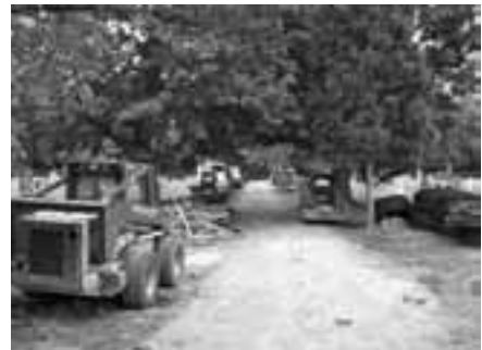
Equipment mobilization before excavation