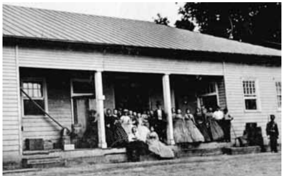
The Washington Arsenal, circa 1863

Newspaper accounts of the incident, including additional details of the tragedy, as well as many others related to the history of this Cemetery, are available on Congressional Cemetery's website at www.congressionalcemetery.org under the section called "HCC Archives." ~